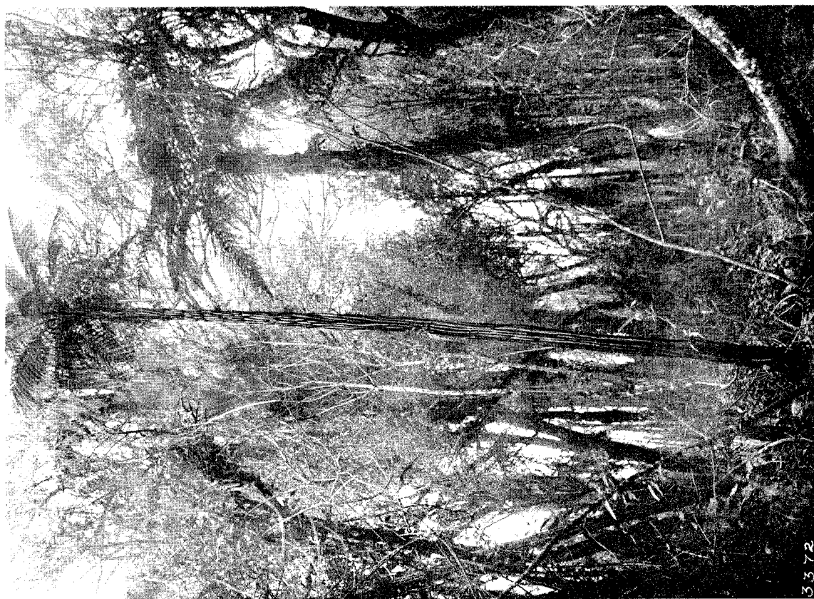
THE SLENDER TREE-FERN (WIEBE), ( Dicksonia squarrosa ).

The bases of the old stipites adhere persistently to the trunk.